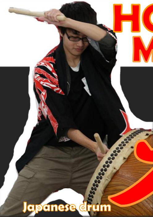
Japanese drum performance