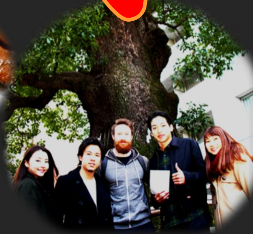
Sacred camphor tree