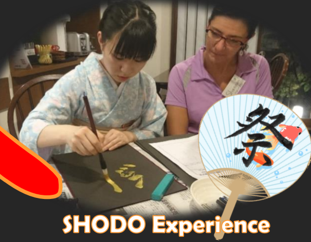
SHODO Experience on a fan