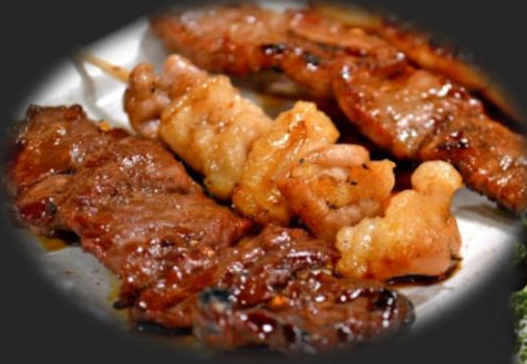
" YAKITORI "